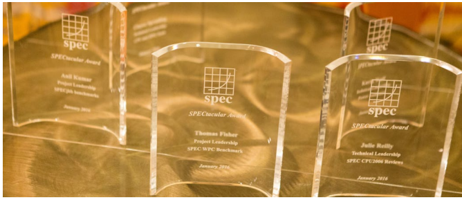
SPECtacular awards await the awarding ceremony in Freemont, 2016.